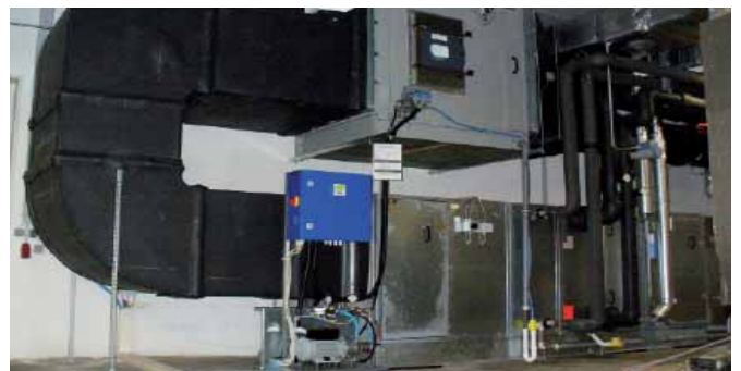
The steam system was kept in place for back-up

When replacing steam humidifiers, a new duct section is unavoidable, as the absorption distance of such systems is not adequate for high-pressure nozzles. However, experience has shown that even in this case, retrofitting is practicable and economically justifiable.