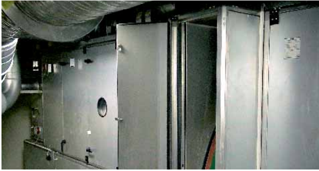
Air handling unit with heat recovery wheel, return air in the top, supply air in the bottom