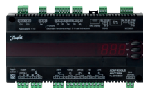
AK-CC 550 features energy optimisation of the complete case and predefined application types for quick adaptation to different cases or cold room setups.

Danfoss brought the first AKV electronic expansion valve to market almost three decades ago together with our revolutionary ADAP-KOOL® controllers. During the years, the system has been refined and perfected.