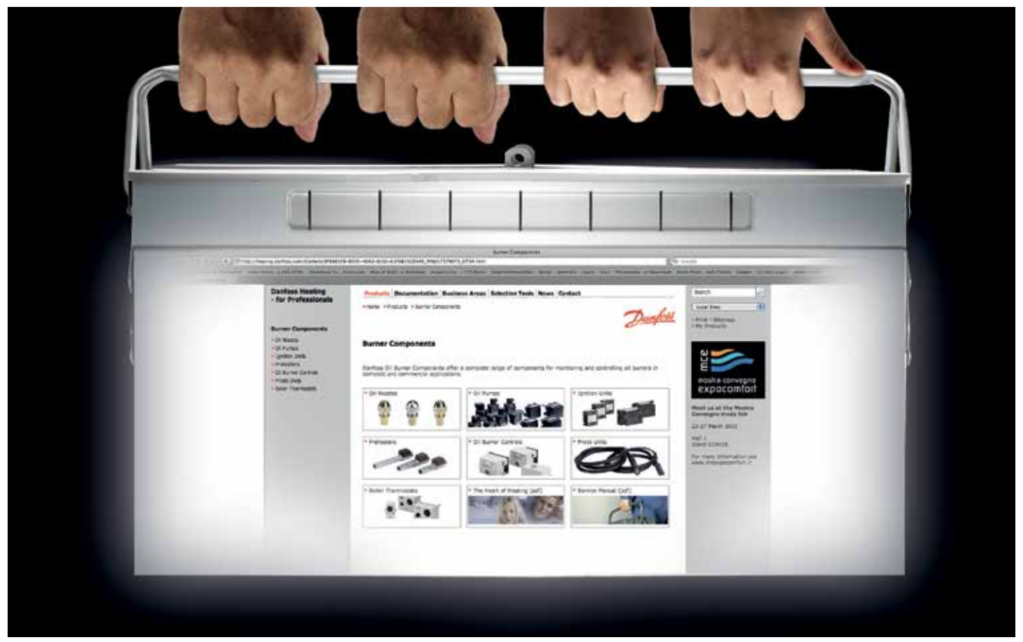
On burner.danfoss.com you can find instructions, datasheets and brochures to download.

Our Service Manual is intended as an aid in your daily routine. We therefore hope that the manual will make your work with Danfoss Burner Components easier.