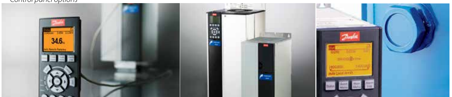
Control panel options

provided by the speed reduction at night and the limited number of starts and stops.