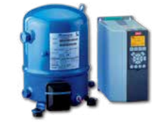
VTZ 038-G & Compressor Drive 4.0 kW