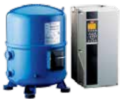
VTZ 242-G & Compressor Drive 22.0 kW