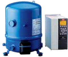
VTZ 086-G & Compressor Drive 7.5 kW